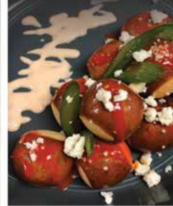
Labriola® Soft Pretzel Bites® Buffalo Style Item: #7421102