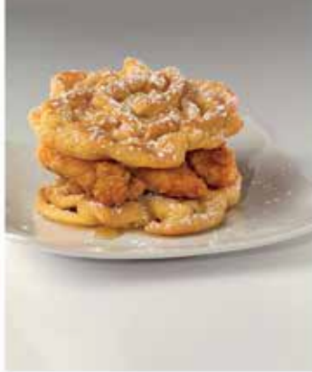
Chicken & Waffles Item: #4508