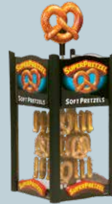
MODEL 850D & 2000 WARMER