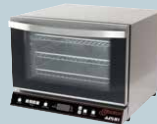
MODEL JJ501 OVEN