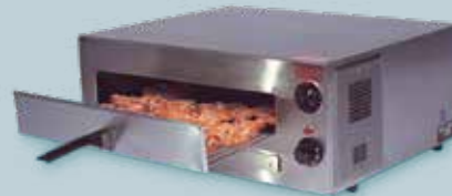
MODEL 560E OVEN