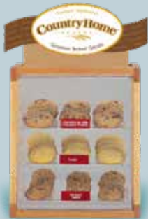
MODEL 246-W DISPLAY