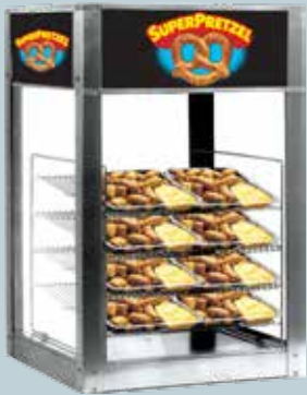
MODEL 925 WARMER