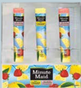
MODEL 496 DISPLAY