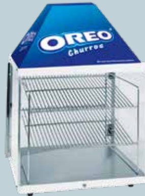
MODEL 312 WARMER